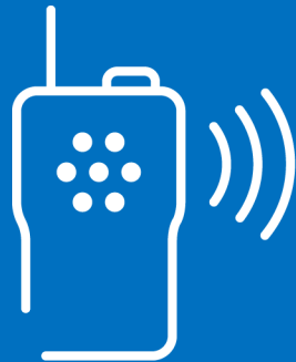
AT&T Enhanced Push-to-Talk