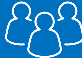
AT&T Workforce Management