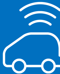
AT&T Fleet Management